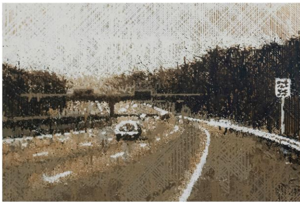
495 South (1970)